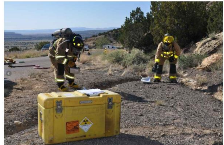
Photo from TEPP exercise