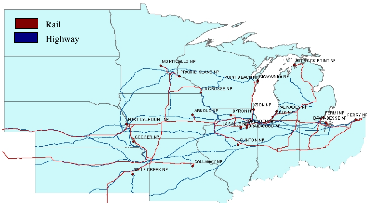
Fig. 4: Final rail and highway route results of the Midwestern route identification project

The work group presented the suite of routes to DOE a year and a half after beginning the route identification process. The routes were presented as those that meet the regional criteria for ensuring the selection of safe routes and the region's suggested starting point for national route selection discussions. The Midwestern states realize that the suite does not necessarily reflect the routes that DOE will ultimately use to ship spent fuel and high-level waste to Yucca Mountain. However, they do hope that the suite will be a primary input into the development of the national suite of routes, along with other regional input and operational considerations. The states believe that the work group spent considerable time developing criteria, producing and analyzing potential routes, and consulting with other stakeholders, and therefore DOE should give the results the utmost consideration.