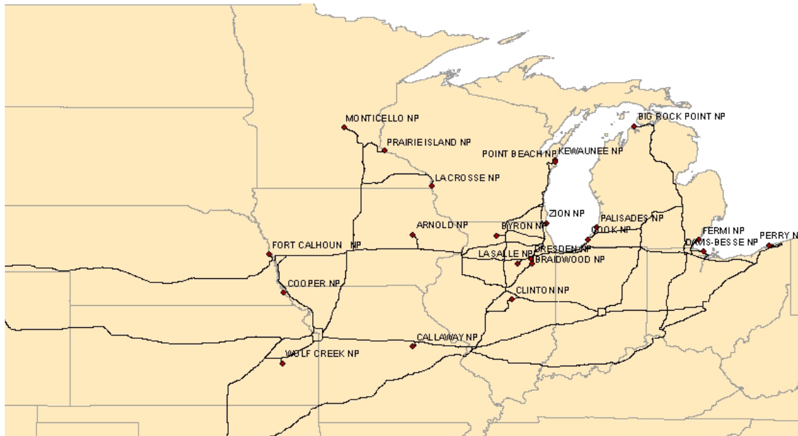
Fig. 2: All highway routes analyzed in the Midwestern route identification project