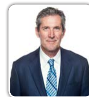
Premier Brian Pallister

Presenter: Mr. Gary Doer, Former Manitoba Premier and Former Canadian Ambassador to the United States