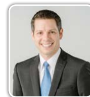
Mayor Brian Bowman