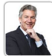
Keynote speaker Gary Doer