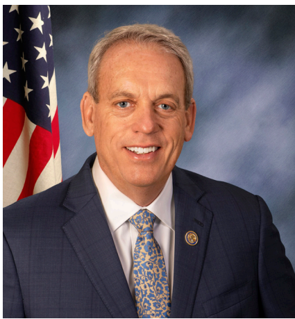
by Illinois Sen. Dale Fowler

Making new laws is only one of many ways senator views his role in economic recovery