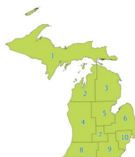
Regional Data (Interactive)