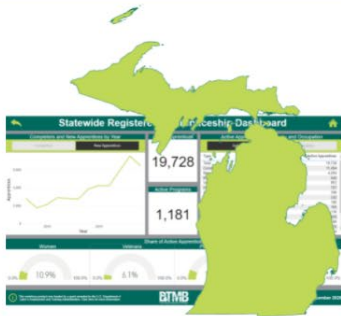
Statewide Data (Interactive)

Welcome to the Michigan Registered Apprenticeship Dashboard. This dashboard houses registered apprenticeship data for Michigan and its 10 Prosperity Regions. Please choose from the options below to get started.