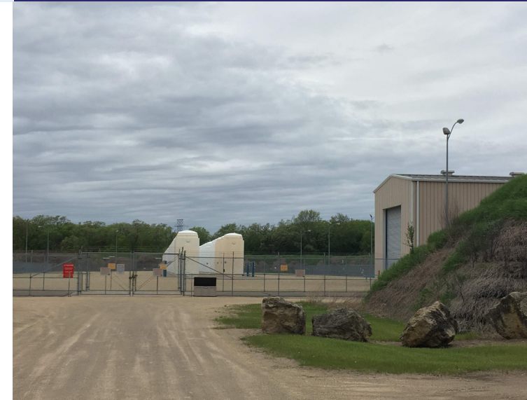
Spent nuclear fuel dry storage casks at Prairie Island Nuclear Generating Station near the Prairie Island Indian Community

Midwestern Radioactive Materials Transportation Committee