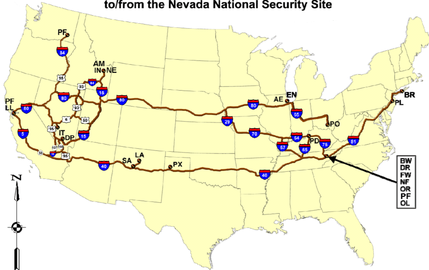
Figure 1 - FY 2010 National Low-Level and Mixed Low-Level Waste General Transportation Routes to/from the Nevada National Security Site