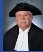
2ND VICE CHAIR