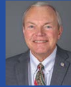
1ST VICE CHAIR