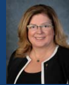
1ST VICE CHAIR