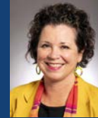
2ND VICE CHAIR